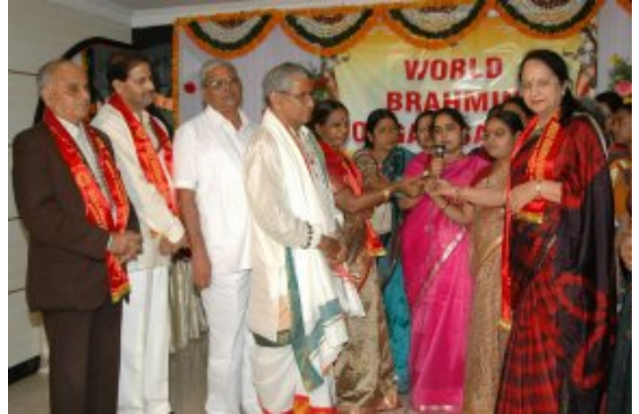
Hyderabad: WBO Mini-convention