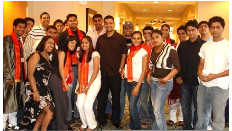
The Youth Group