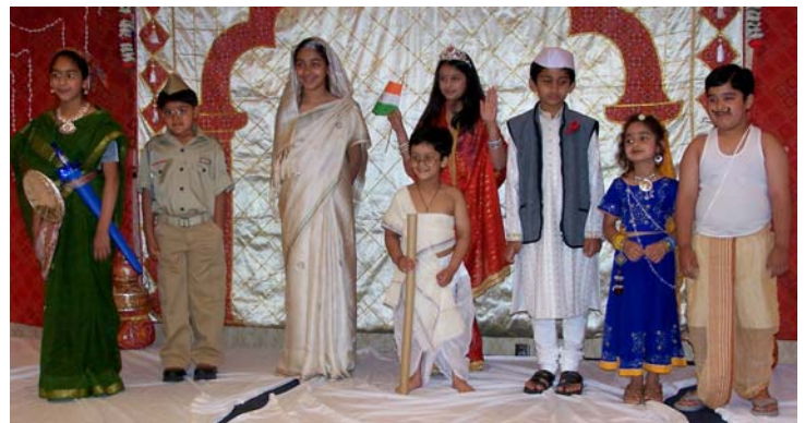
A Personality Parade - Leaders of India